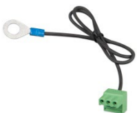
Connector with preassembled DC minus cable (included)

The BatteryProtect disconnects the battery from non essential loads before it is completely discharged (which would damage the battery) or before it has insufficient power left to crank the engine.